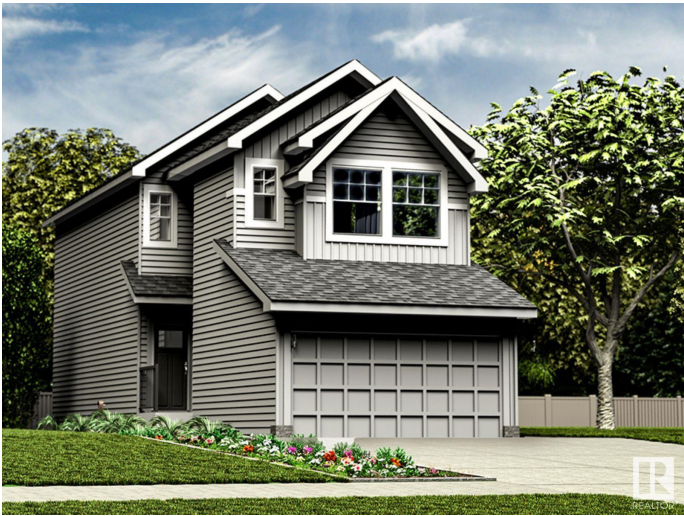
The Archer 20 | 1,585 Sq. Ft.