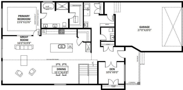
MAIN FLOOR PLAN 1671 SQ FT GARAGE 543 SQ FT