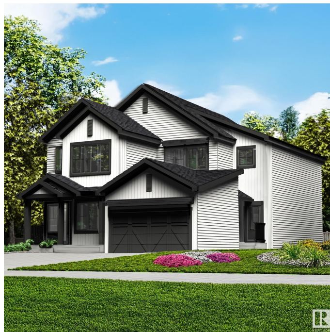
The Retreat | 1,367 Sq. Ft.

GREAT LEGAL SUITE POTENTIAL! Discover this investor's dream in a stunning modern duplex with nearby trails and natural scenery. This 1,367 sq ft 3-bedroom, 2.5-bath home boasts a main floor open-concept layout with 9 ft. ceilings, luxury vinyl plank flooring, and a gourmet kitchen featuring a central island with quartz countertops, undermount sink, flush eating ledge, over-the-range microwave, full-height tiled backsplash, and soft-close doors and drawers. Upstairs, retreat to the expansive primary suite featuring a walk-in closet and a luxurious 4-piece ensuite that offers a spa-like atmosphere with double sinks. There are two additional bedrooms, a 3-piece bathroom, and a convenient laundry room. Additional features include a double car garage with a floor drain, a separate side entrance, large triple-pane windows, and a sliding patio door. In the basement, you will find rough-ins for a potential future legal suite, too! Maximize your rental yields with this high-quality, versatile property.